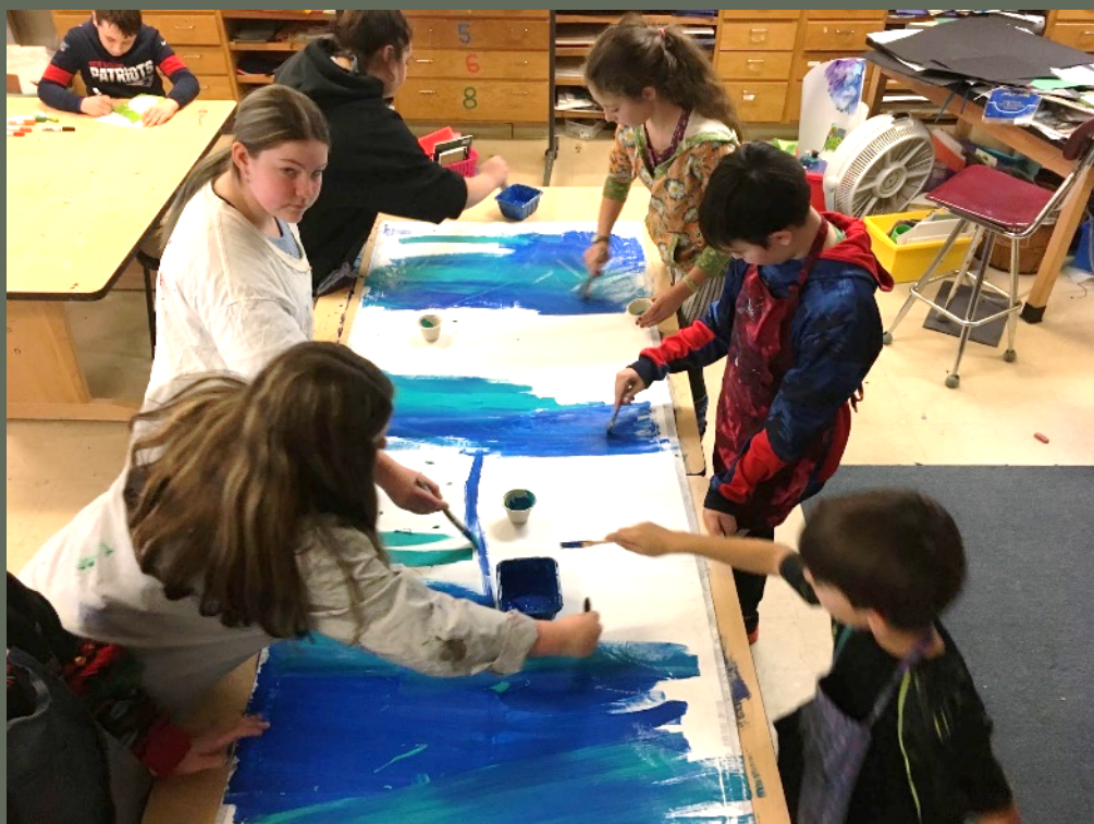
Community painting @ Barnet