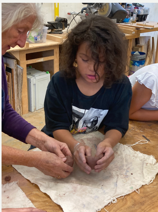
Clay making @ Cabot

Recently, while visiting a kindergarten classroom, we were chatting with some students who were drawing multimedia creations of castles and families. In the course of our visit one of the artists told a story about a dog in the picture that was hurt. Another artist at the table stopped their work and asked, “Is your dog ok?”. This is an example of compassion; this child was sympathetic and then acted on their emotion to express caring for their classmate.